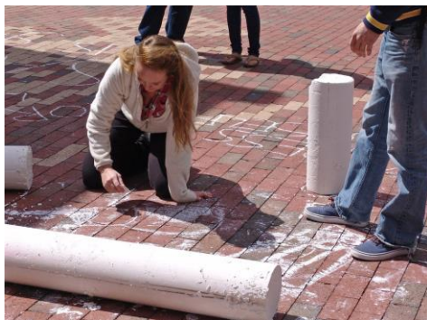
View of Allora & Calzadilla's Chalk (1998/2013) in the exhibition More Love: Art, Politics and Sharing since the 1990s, Ackland Art Museum, University of North Carolina at Chapel Hill, 2013

MINNEAPOLIS, AUGUST 27, 2018 — Based in Puerto Rico, collaborators Jennifer Allora (b. 1974) and Guillermo Calzadilla (b. 1971) create works that reach across sculpture, video, performance, and photography. Chalk (1998) is an ongoing art project in which the artists place human-size sticks of chalk—each piece measuring 64 inches in length—in public spaces for passers-by to use as they choose. Previously installed in Lima, Peru; Paris; Boston; and New York, the work takes on a new personal and political identity in each new location.