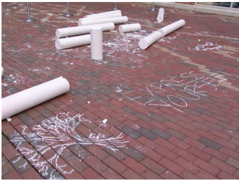
View of Allora & Calzadilla's Chalk (1998/2013) in the exhibition More Love: Art, Politics and Sharing since the 1990s , Ackland Art Museum, University of North Carolina at Chapel Hill, 2013