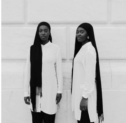
Al Taw'am.