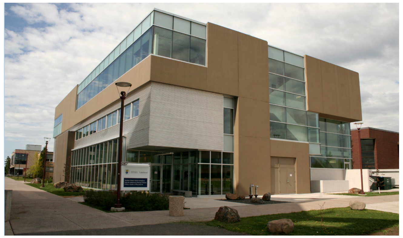
Northern Ontario School of Medicine at Lakehead University

Though remuneration incentives can help to financially equalize specialties, encouraging students to choose psychiatry goes beyond remuneration – students also want to choose a specialty that is personally and professionally rewarding. Unfortunately, the field of psychiatry is wrought with stigma and misconceptions of the practice being at best, unfulfilling or at worst, unsafe.<sup>31</sup> Addressing these misconceptions is essential to improving medical students' attitudes about the profession. Furthermore, emphasizing the rewarding aspects of the profession – including meeting the clinical needs of a vulnerable population, and the uniquely interdisciplinary nature of the profession – can help to attract more talent to the profession.