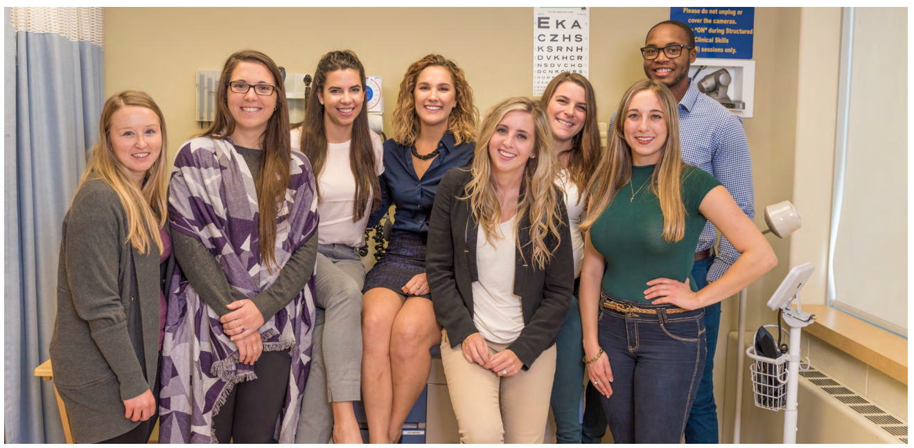
Northern Ontario School of Medicine students

It is clear that enhancing and maintaining a robust pre-clerkship program in Canadian medical schools is vital to recruit new talent to psychiatry. Investing in this experience improves attitudes about psychiatry and attracts medical students to the profession.