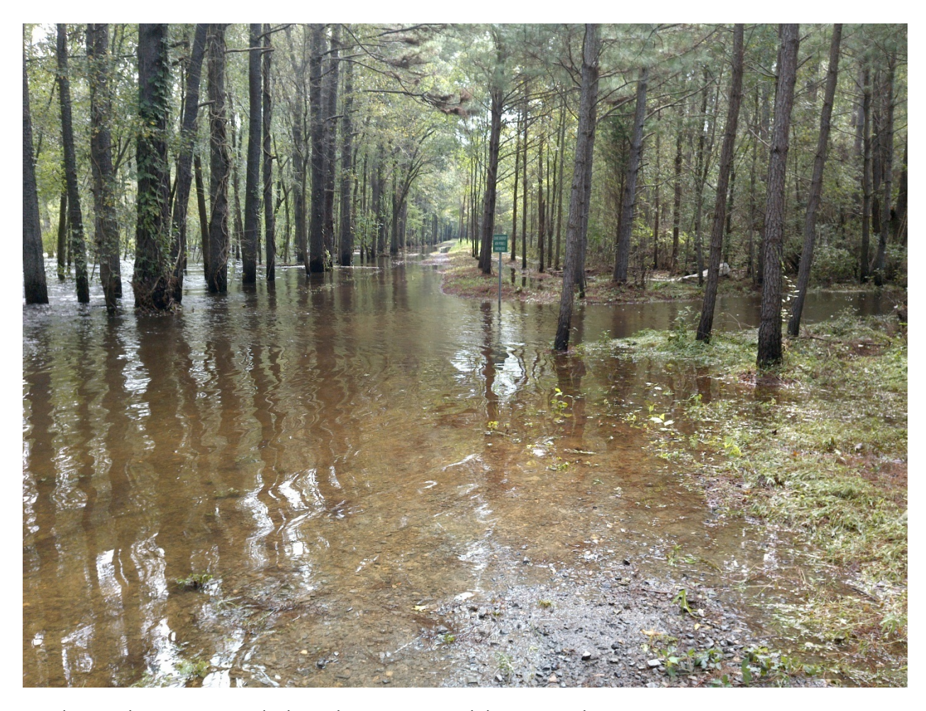
Conditions along access roads throughout inactive ash basin complex.