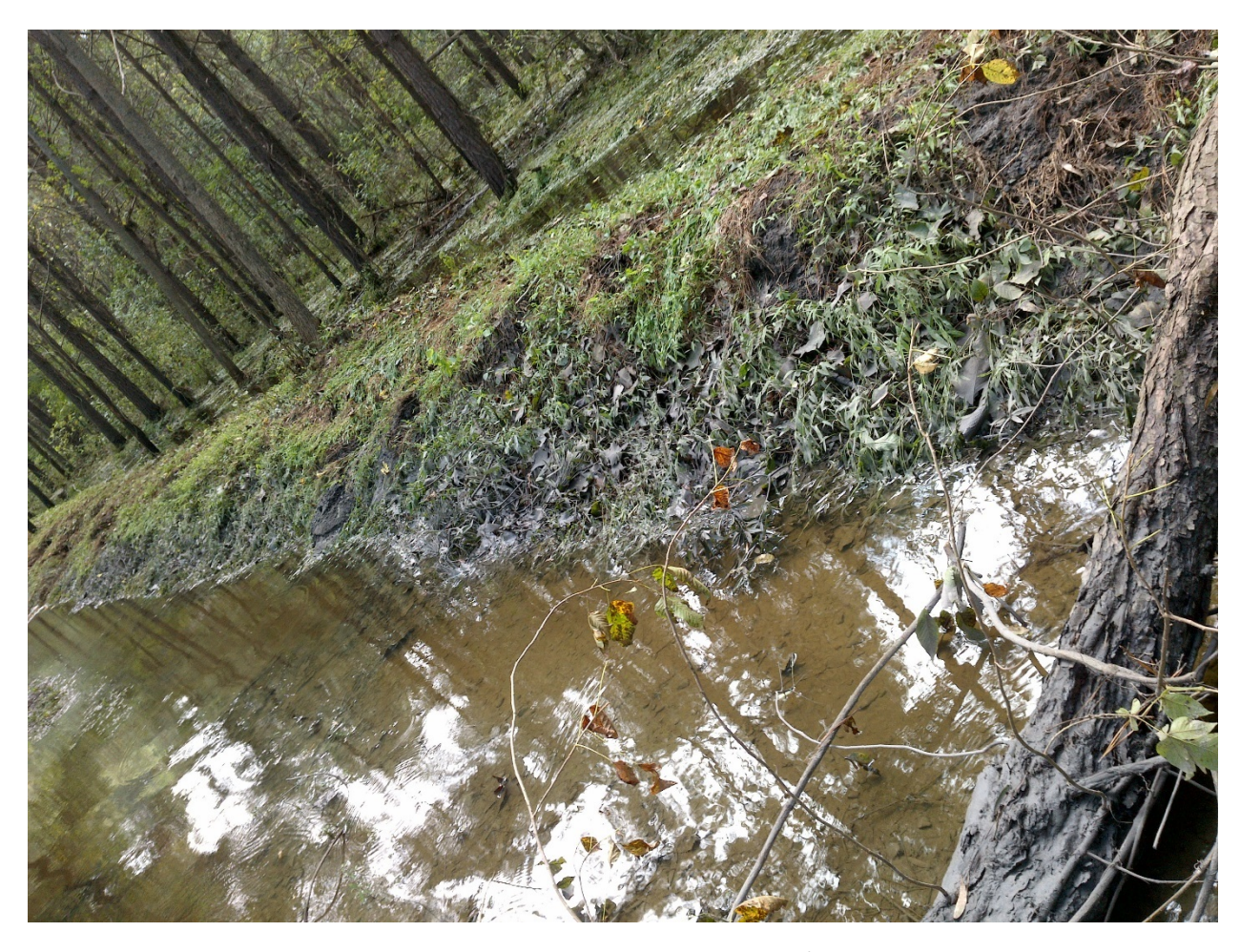
Flooded ash basin complex behind dike wall boundary. Some silting/ash along outside of ash basin dike wall.