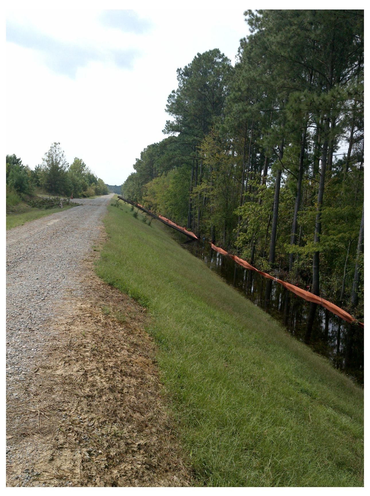
Neuse River floodwaters encroaching on active ash basin dike wall.