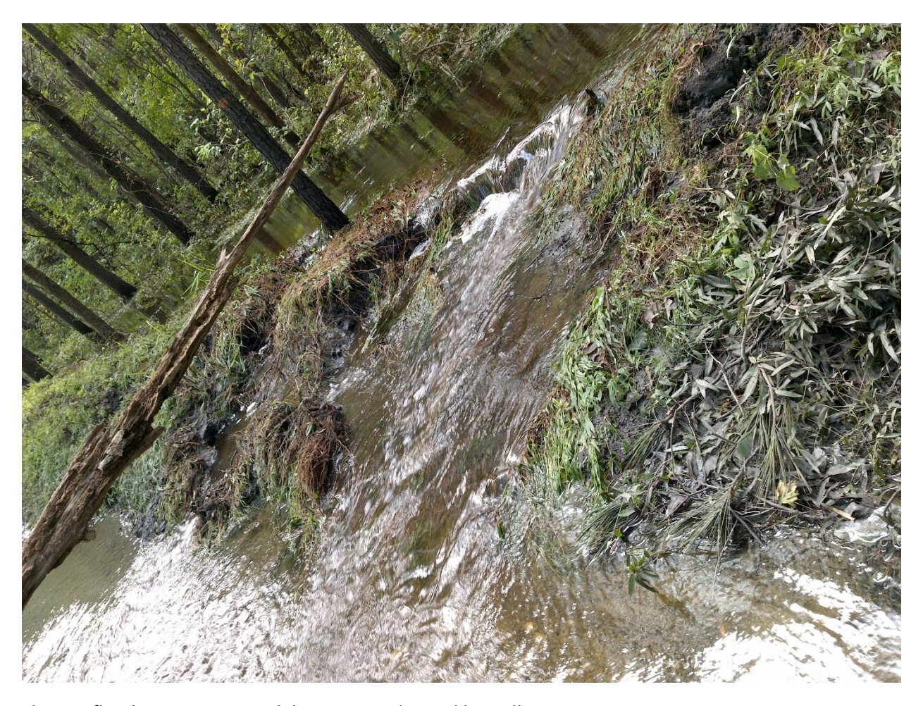
Flowing floodwaters exiting ash basin across basin dike wall.