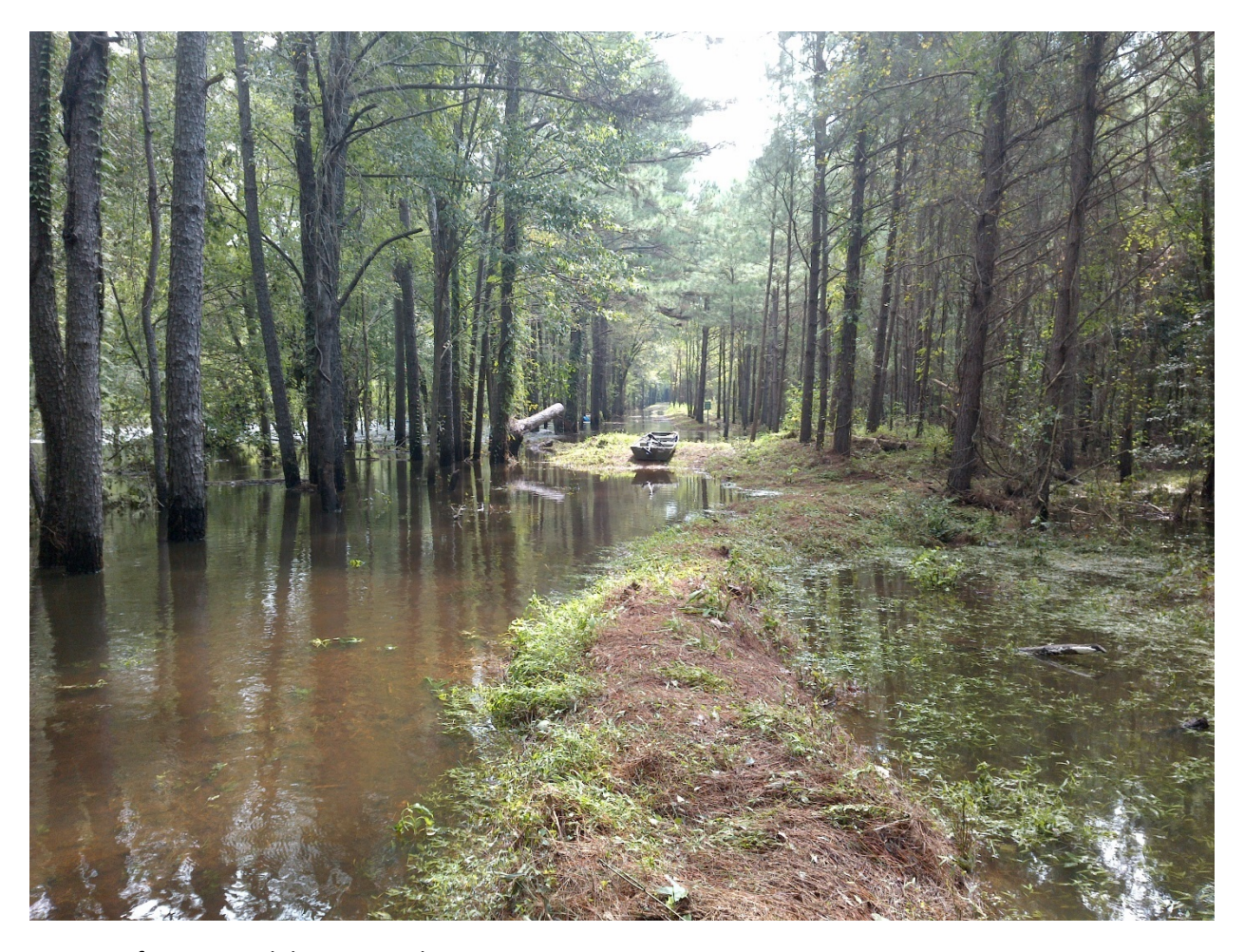
Interior of inactive ash basin complex.