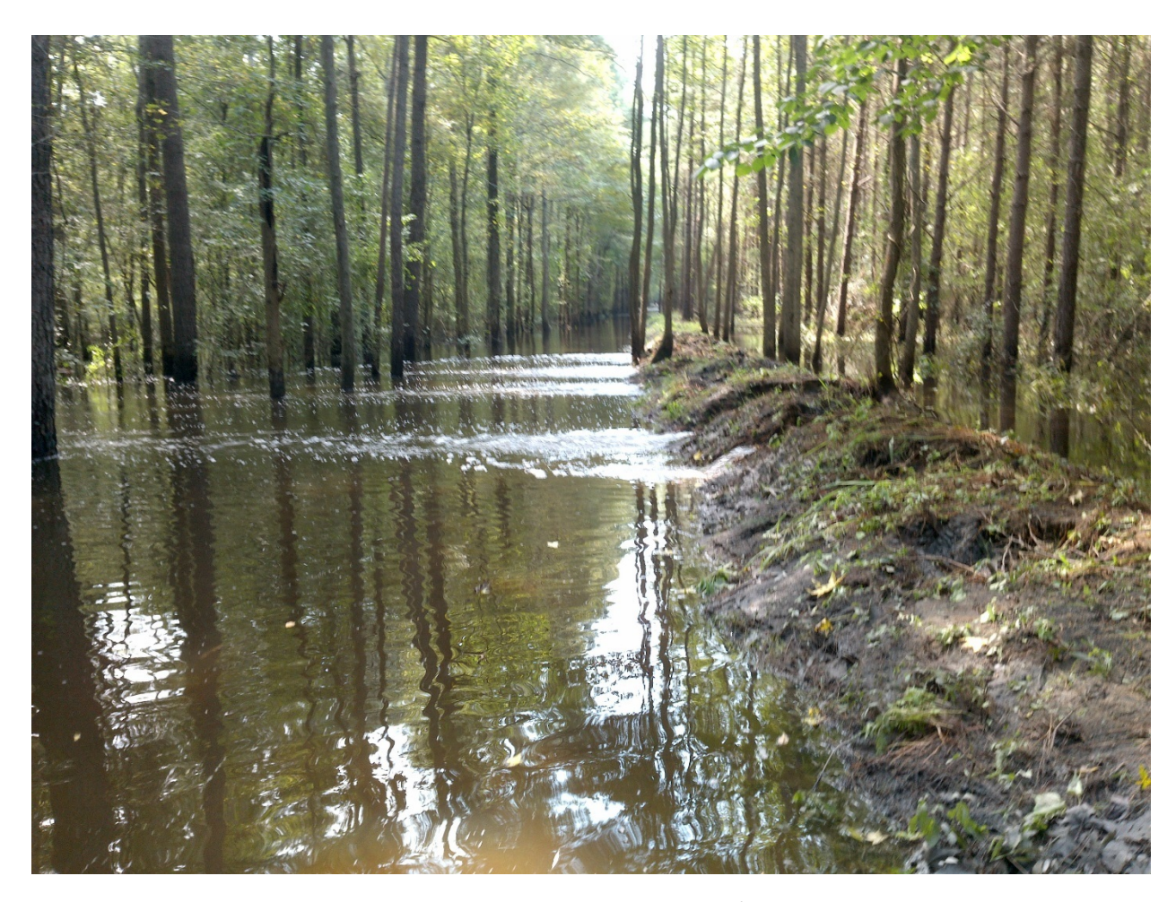
Flooded ash basin complex. Water flowing from ash basin, across/through dike, across access road to Halfmile Branch.