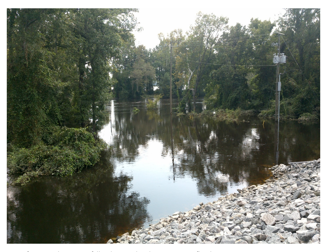
Area of Active Ash Basin outfall, submerged under Neuse River floodwaters.