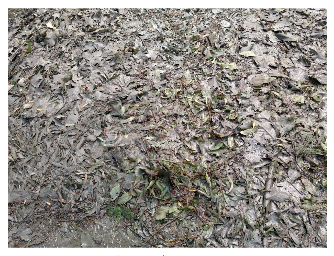
Settled ash redeposited in vicinity of original wash/sloughing.