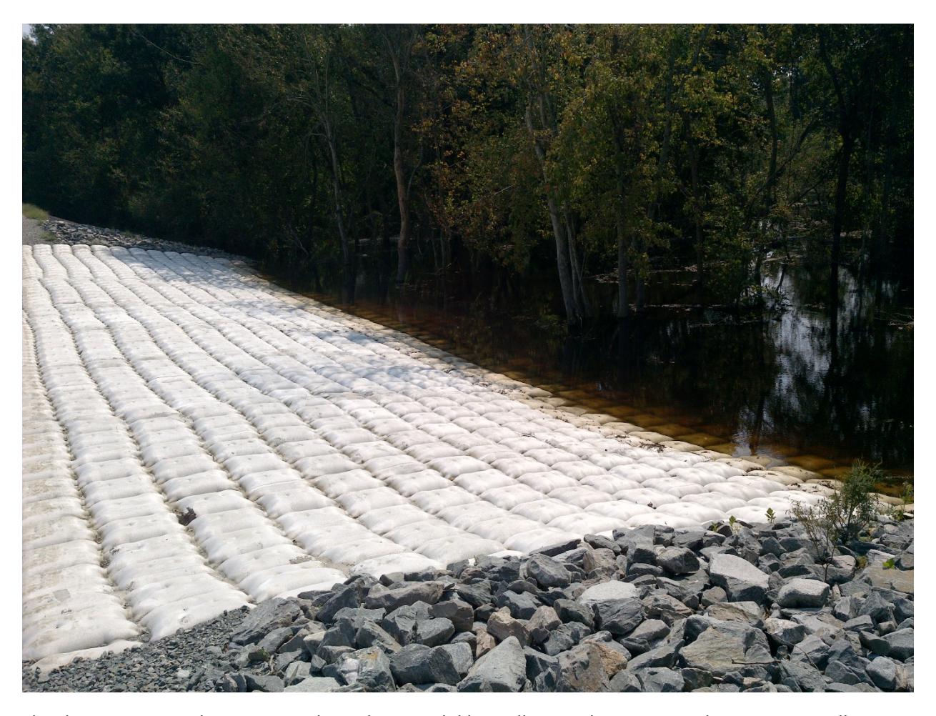
Floodwaters encroaching on outside cooling pond dike wall at newly constructed emergency spillway.