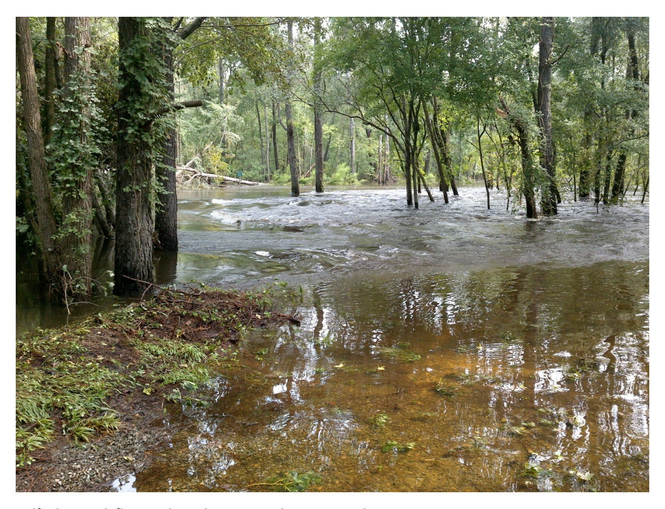
Halfmile Branch flowing through Inactive Ash Basin Complex.