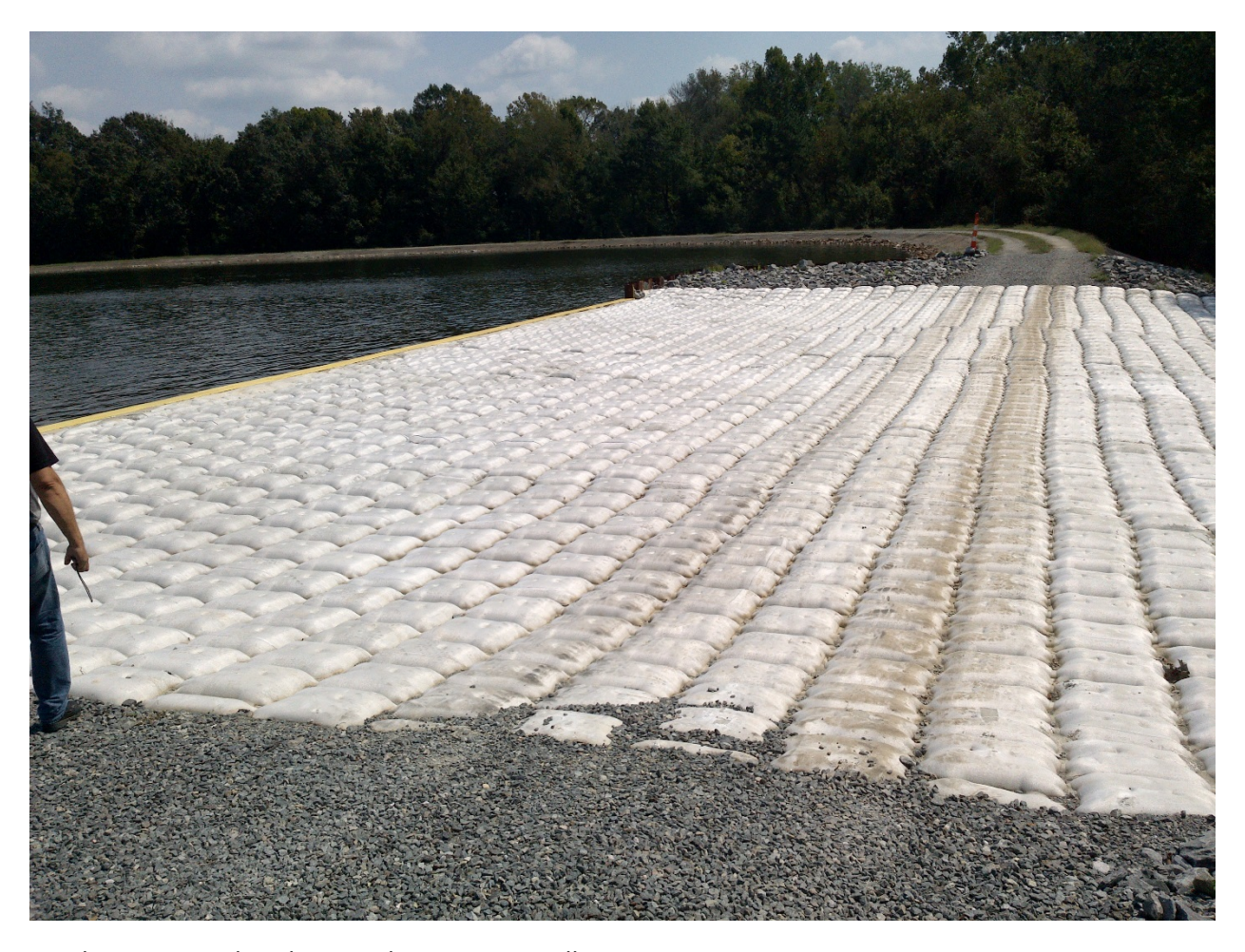
Newly constructed cooling pond emergency spillway.