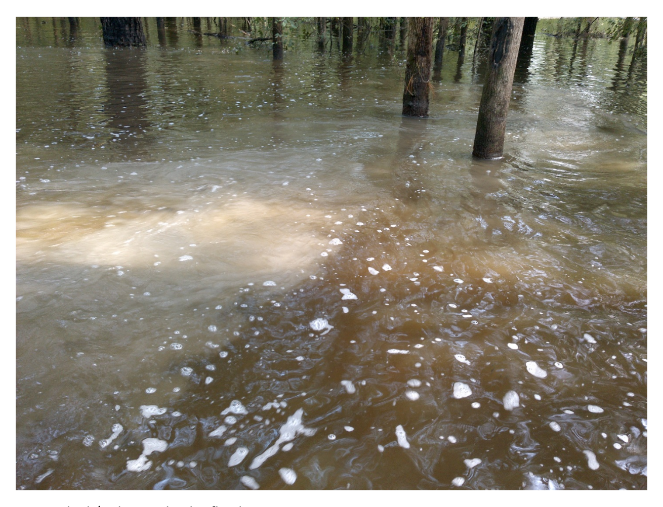
Potential ash/sediment cloud in floodwaters.