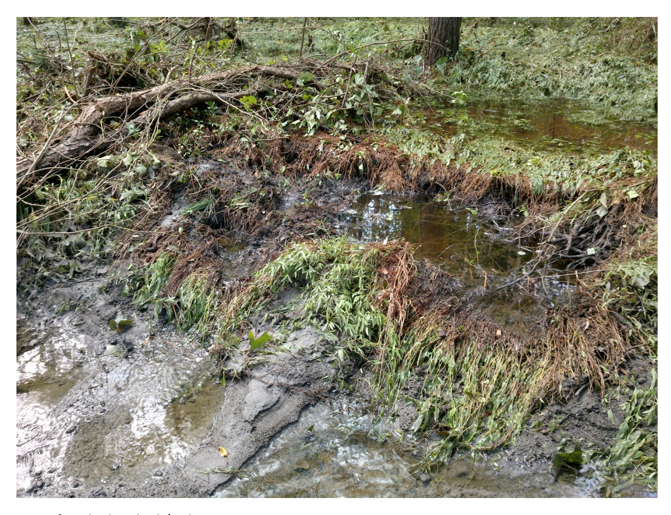
Area of washed coal ash/sediment.