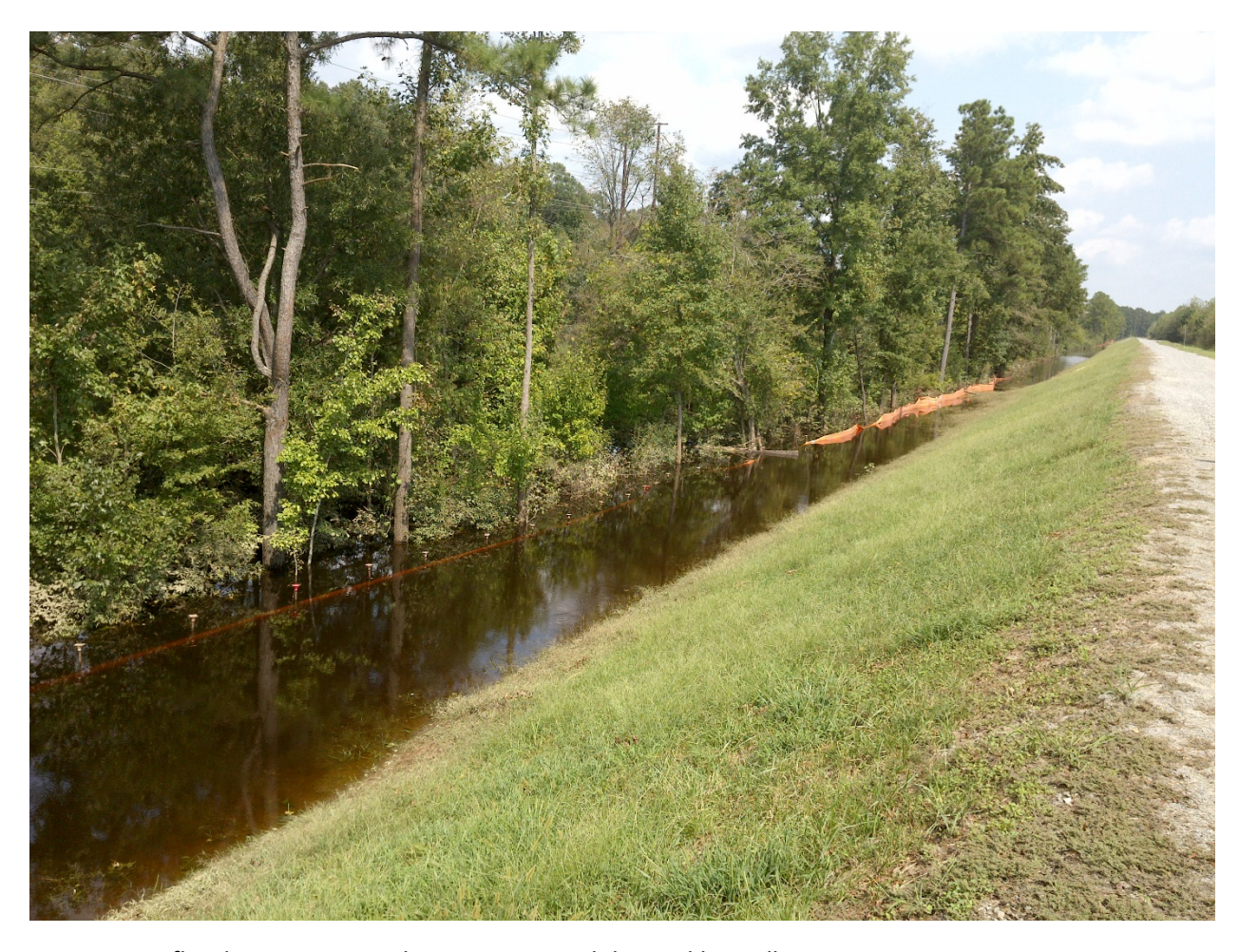
Neuse River floodwaters encroaching on active ash basin dike wall.