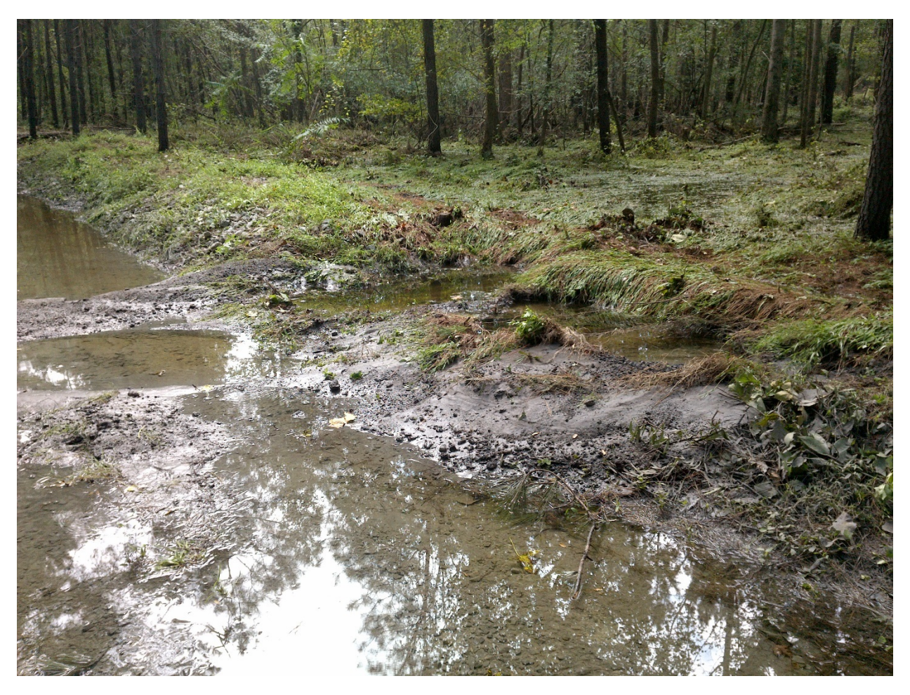
Area where some volume of ash sloughed off, washed over, and resettled outside of original as boundary.